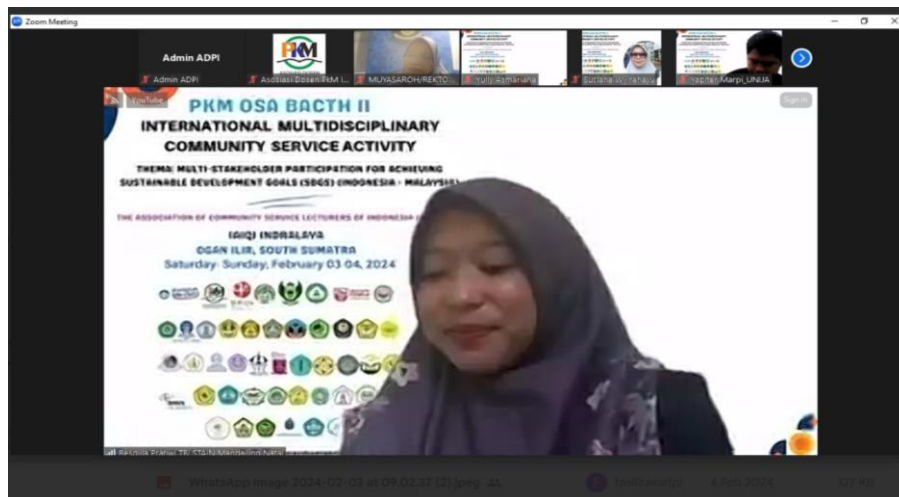
Picture 1. Opening Ceremony