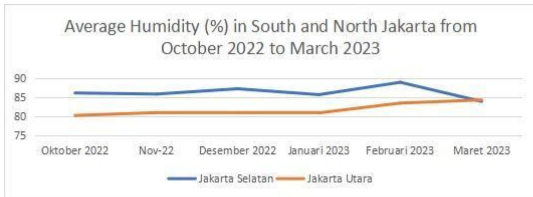
Fig. 2 Plant Conditions in December 2022

Then, the climate conditions from October 2022 to January 2023 are shown in Fig.2.