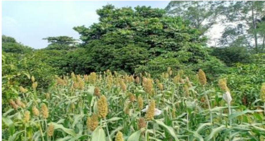
Fig. 1 Average Temperature Conditions in the Research Area from October 2022 to March 2023

Then, the climate conditions from October 2022 to January 2023 are shown in Fig.2.