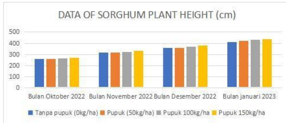
Fig. 5 Effect of Urea Fertilization Dosage from October 2022 to January 2023

potential of \pm 54.30 ton/ha, resistance to leaf rust and spots, as well as moderate and high resistance to anthracnose and stem rot (Unpublished Ekowahyuni et al., 2023, "The Effect of Plant Spacing on Sweet Sorghum Variety Bioguma 2 in the Ciganjur Experimental Garden, West Jakarta"). The effect of varieties on fertilization from October to January 2023 can be observed in the Fig. 5.