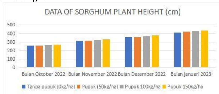
Fig. 4 Shape of Sweet Sorghum Fruit

The interaction between fertilizer dosage and varieties on plant height can be observed in the Fig. 4.