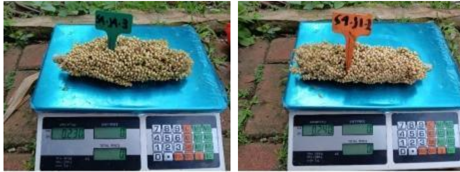
Fig. 3 Average Humidity Conditions from October 2022 to March 2023

In Jakarta's climate conditions, sweet sorghum growth remained good each month from October 2022 to January 2023. The highest and lowest growth was in January and October 2023 at a fertilizer dosage of 150 kg/ha, reaching 400 cm and 250 cm, respectively. Therefore, the continuous application of N fertilizer affects the loss of soil-bearing capacity (Suminarti, 2019). Based on Saputra's research (2021), the best dosage is between 50 kg/ha and 250 kg/ha.