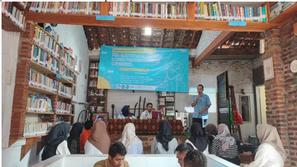
Figure 2: Presentation of Materials

In this training, pretest and post test were held to measure the cognitive knowledge of participants and their improvement. This is done so that the PKM team knows the extent of effectiveness in delivering material and the right method in delivering PKM material to participants. The pretest and post test consisted of 8 statements with 4 multiple choices made in a google form and distributed to participants filled out for 5 minutes.